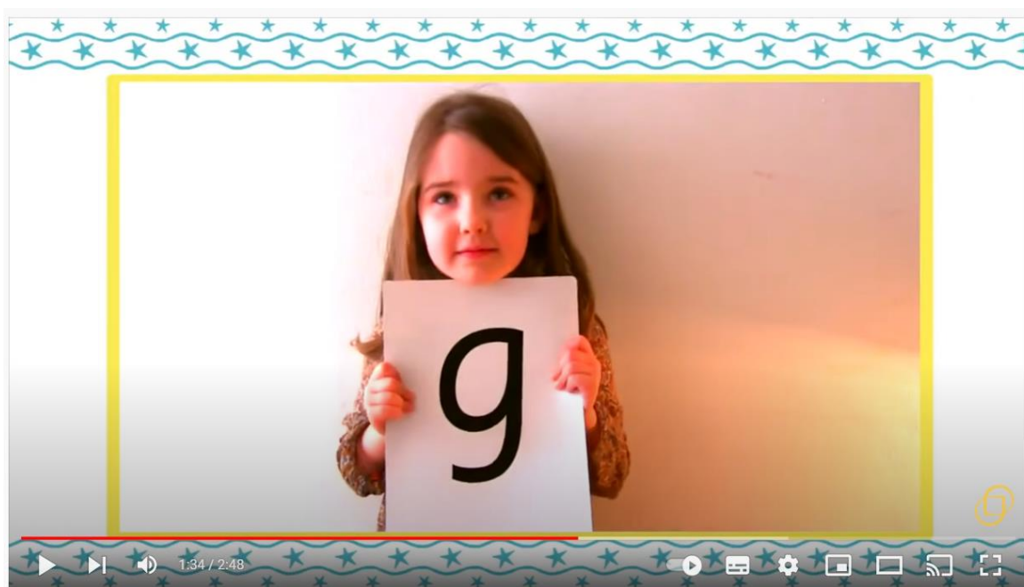
Parent video: How to say the sounds

Please watch this short video so you are clear on the sounds children should be making when using "Fred Talk" to help read words.