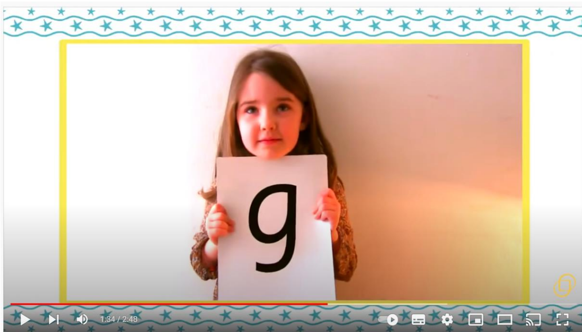
Parent video: How to say the sounds

N.B. This is Fred , he is a frog. He cannot say words, he can only speak in sounds: