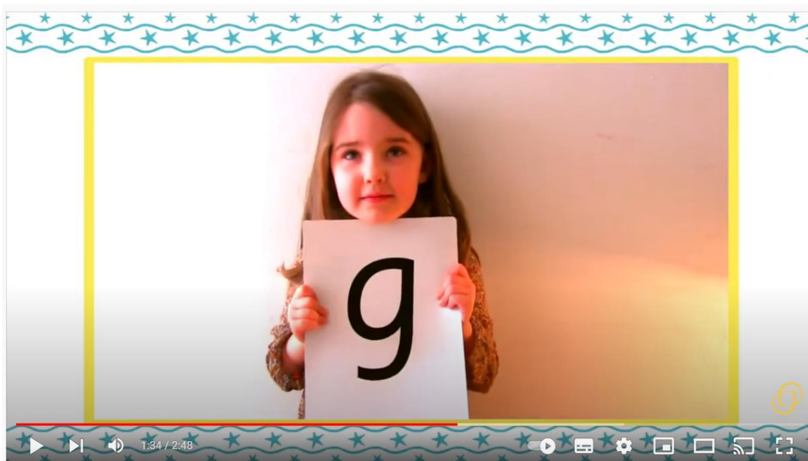
Parent video: How to say the sounds

Please watch this short video so you are clear on the sounds children should be making when using "Fred Talk" to help read words.